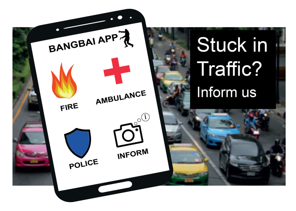
Figure 4: An example of a poster promoting the use of the "Inform" function of the Bangbai App